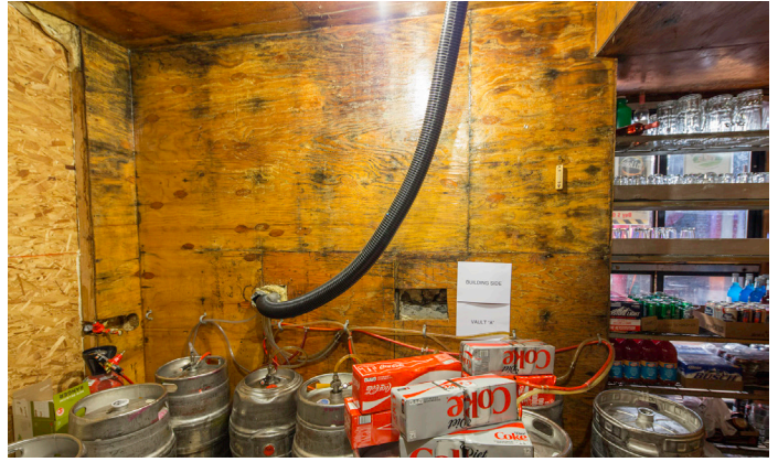
4393 - Building Side Wall