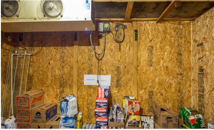
4386 - Street Side Wall