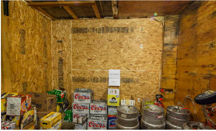
4390 - Right Side Wall