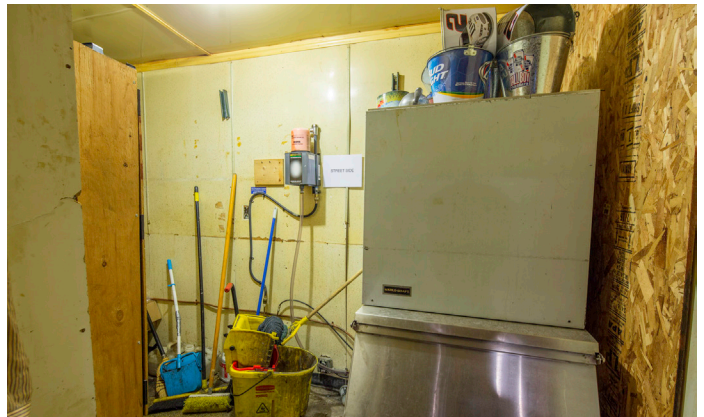
4384 - Street Side Wall