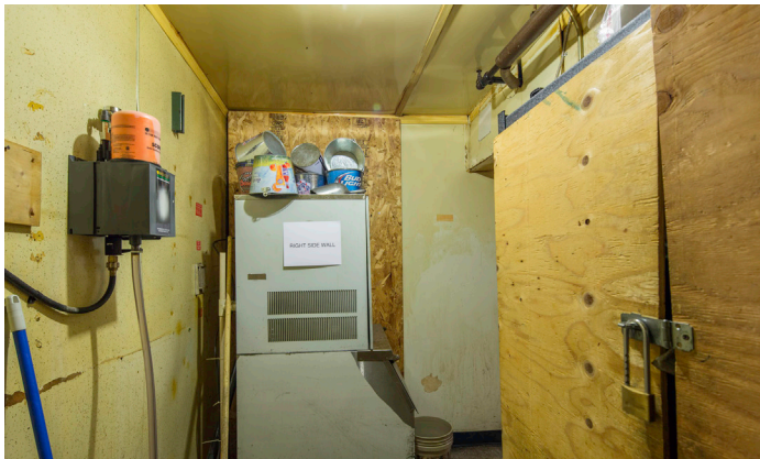
4383 - Right Side Wall