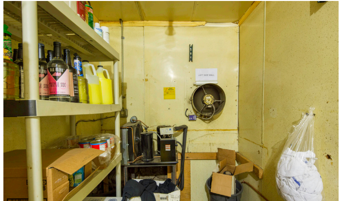
4382 - Left Side Wall