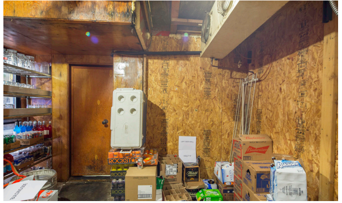
4389 - Left Side Wall