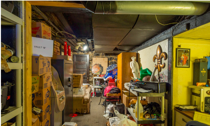
4395 - Entry