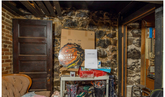
4396 - Street Side Wall