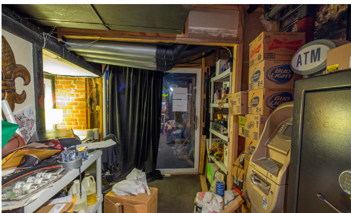
4407 - Building Side Wall