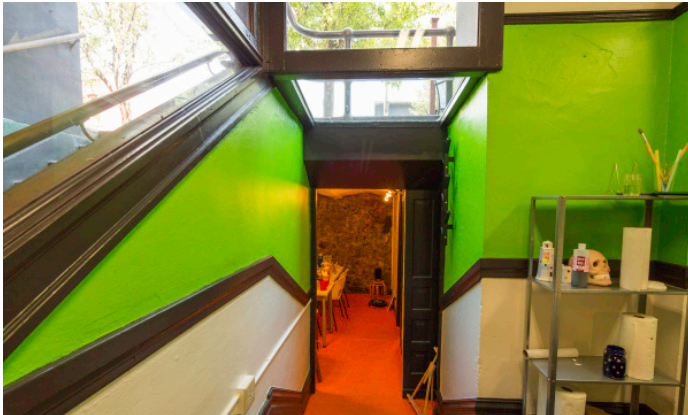
4430 - Entry