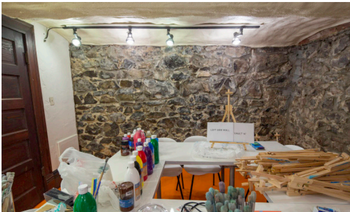
4433 - Left Side Wall