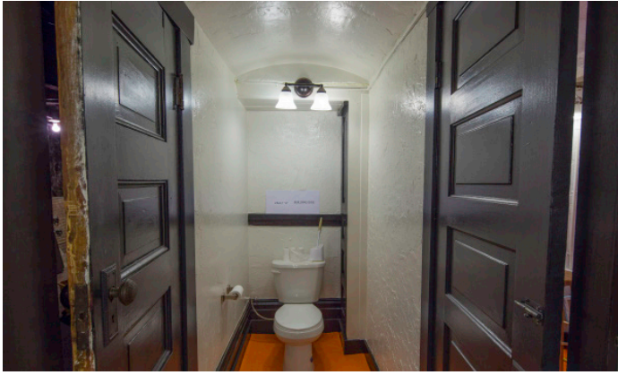
4439 - Building Side Wall