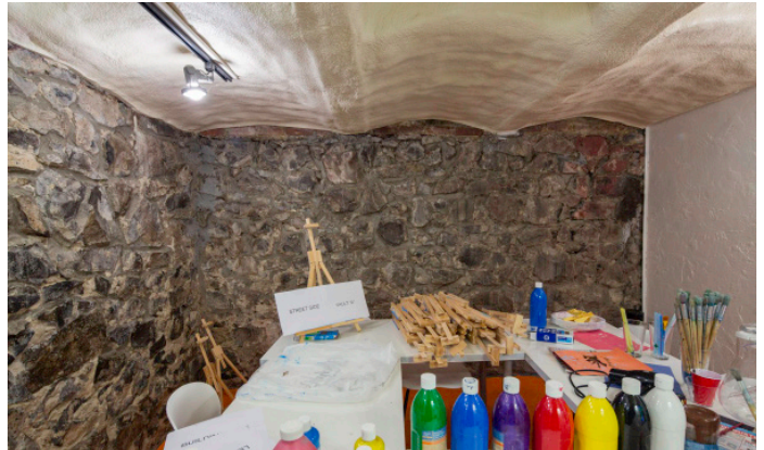
4432 - Street Side Wall