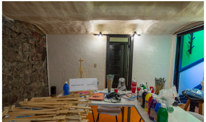
4435 - Right Side Wall